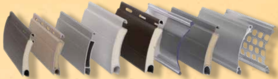
400 Series 440 Series 450 Series 500 Series 520 Series 530 Series 540 Series 560 Series 561 Series