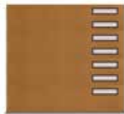
Full Section Stacked