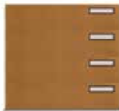
Top Section Stacked