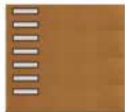
Left Stacked Vertical Column 24" x 6"